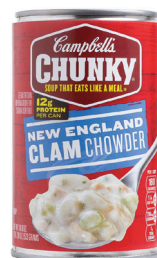
Clam Chowder, 18 oz. Count: 1