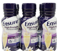
Ensure® Vanilla Shake, 8 oz. Count: 6