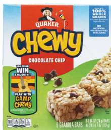
Chewy Granola Bars, 8.4 oz. Count: 8