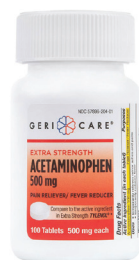
Acetaminophen Extra Strength Tablets, 500 mg. Count: 100