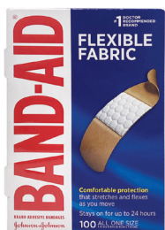
Band-Aids®* Count: 100