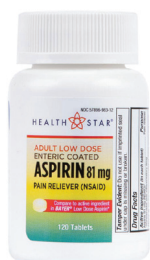
Aspirin, Enteric Coated Tablets, Low Dose, 81 mg. Count: 120