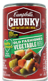
Chunky Vegetable Soup, 18 oz. Count: 1