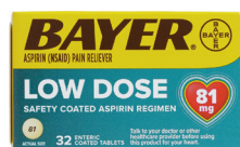
Bayer® Enteric Coated Aspirin, Low Dose, 81 mg. Count: 32