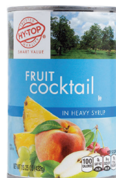
Fruit Cocktail, 14.5 oz. Count: 1