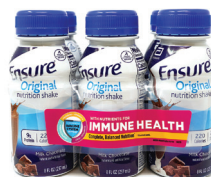
Ensure® Chocolate Shake, 8 oz. Count: 6