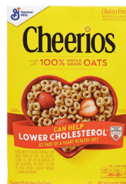
Cheerios™, 8.9 oz. Count: 1