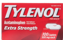
Tylenol® Extra Strength Tablets, 500 mg. Count: 100