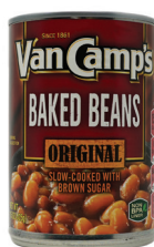
Baked Beans, 16 oz. Count: 1