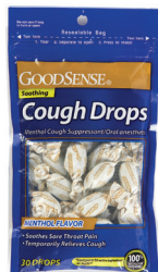
Cough Drops, Menthol Count: 30