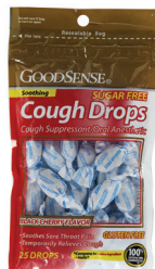
Cough Drops, Sugar-Free, Black Cherry Count: 25