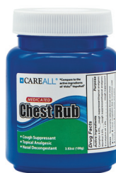
Vapor Rub, 3.5 oz. Count: 1