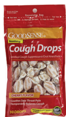
Cough Drops, Cherry Count: 30