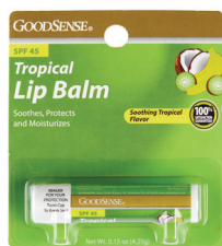
Medicated Lip Balm, 0.15 oz. Count: 1