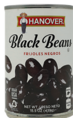
Black Beans, 15 oz. Count: 1