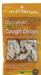
Cough Drops, Honey Lemon Count: 30