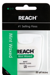
Dental Floss, Reach®, Mint Waxed Count: 1