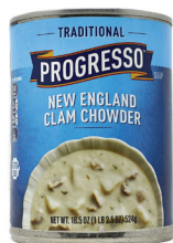
Clam Chowder, 18 oz. Count: 1