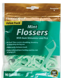
Interdental Flossers Count: 90