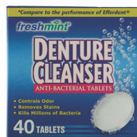
Denture Cleaning Tablets Count: 40