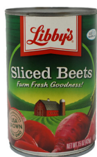
Beets, Sliced, 14.5 oz. Count: 1